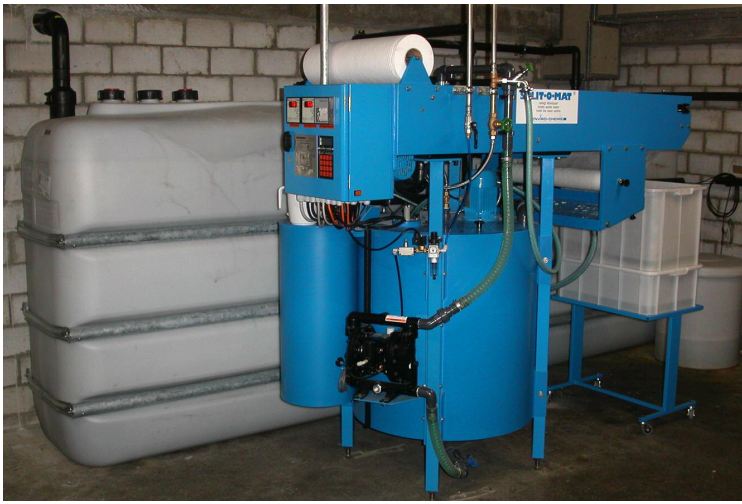
Wastewater plant SOM1100