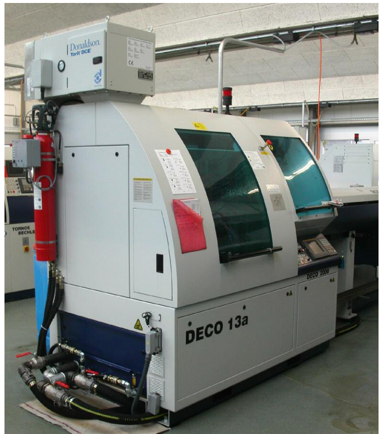
New fully equipped DECO 2000/13