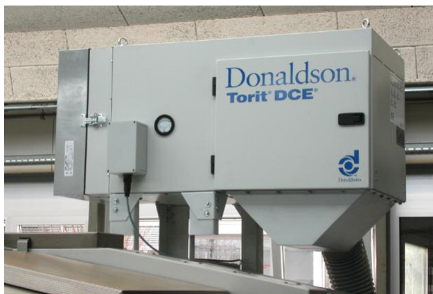
Collet oil cleaning unit

In the last six months we have continued to invest in our CNC machines! In the middle of October 2006, a new and fully equipped DECO 2000/13 was put into service, including a 350 bar high pressure pump, thread-whirling device, high-frequency spindles and collet oil cleaning unit. In addition to this, we have also upgraded two further CNC machines with collet oil cleaning units.