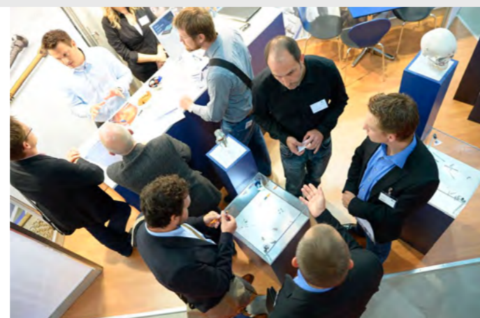
Keen interest being shown at the Andres AG stand at the Swiss Medtech Expo in Lucerne

We attended the newly designed Swiss Medtech Expo in Lucerne (previously the World Medtech Forum) from 15-16 September 2015 as an exhibitor. We would like to once again thank all the visitors for the interest they expressed and for the valuable discussions.