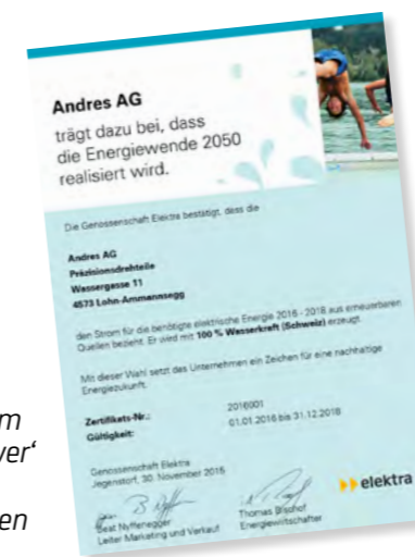
The 'Electricity from hydro-electric power' certificate from Elektra Fraubrunnen